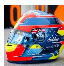
OSCAR PIASTR 81