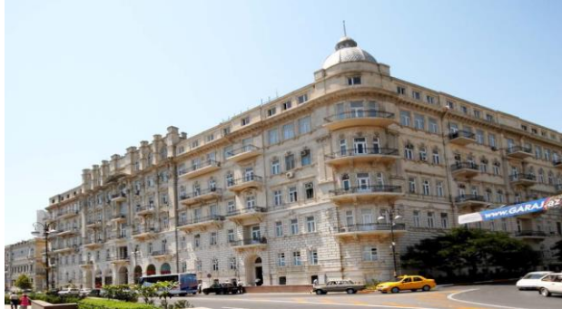
Building 4: 31, Istiglaliyyat Street. Balconies on the building facing Icheri Sheher Metro Station.