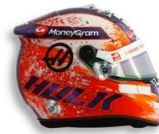
NICO HÜLKENBERG 27

Date of Birth 05/10/1992 Formula 1 Debut 2014 GP Starts 145 GP Wins N/A Pole Positions 1 Podiums 1 F1 Titles N/A Total F1 Points 184