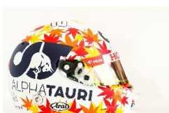
YUKI TSUNODA 22