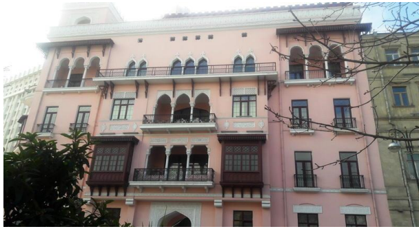
Building 5: 25, Istiglaliyyat Street. 3 rd floor balcony, facing Philharmonic.