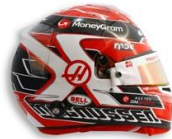
KEVIN MAGNUSSEN 47

Formula 1 Debut 2016 Chassis Haas VF-23 Constructors' Titles N/A Motor Ferrari GP Starts 152 GP Wins N/A Fastest Laps 2 Pole Positions 1 Total Points 245