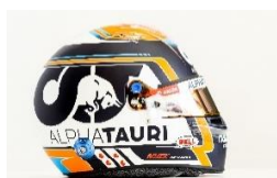
NYCK DE VRIES 21