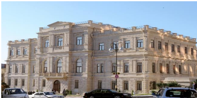
Building 6: Turn 15, 9/11 Niyazi Street. National Museum of Art Building