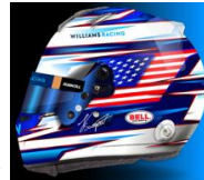
LOGAN SARGEANT 02

Date of Birth 23/03/1996 Formula 1 Debut 2019 GP Starts 62 GP Wins N/A Pole Positions N/A Podiums 2 F1 Titles N/A Total F1 Points 202