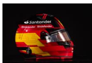
CARLOS SAINZ 55

Date of Birth 16/10/1997 Formula 1 Debut 2018 GP Starts 105 GP Wins 5 Pole Positions 18 Podiums 24 F1 Titles N/A Total F1 Points 874