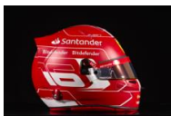
CHARLES LECLERC 16

Formula 1 Debut 1950 Chassis SF-23 Constructors' Titles 16 Power Unit Ferrari GP Starts 1057 GP Wins 242 Fastest Lap 259 Pole Positions 242 Total Points 9292