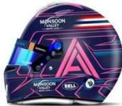
ALEXANDER ALBON 23

Formula 1 Debut 1977 Chassis FW45 Constructors' Titles 9 Power Unit Mercedes F1 M14 E Performance GP Starts 798 GP Wins 114 Fastest Laps 133 Pole Positions 128 Total Points 3587